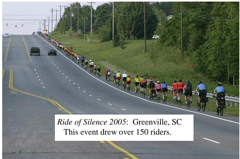
Ride of Silence 2005: Greenville, SC This event drew over 150 riders.

Cyclist will be expected to maintain their positions on the road.